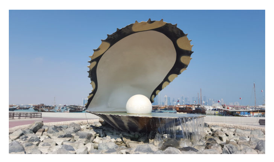
Fig. 2.1 A big shell is reminiscent of the previous pearl diving era

they are the foundation of Qatar's future knowledge-based economy (KBE)" (QF, 2013, p. 2).