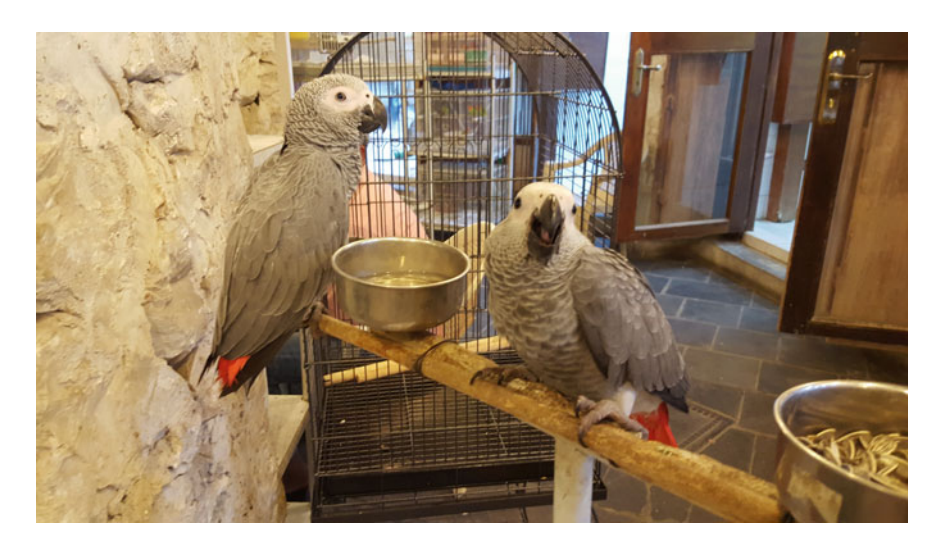
Fig. 2.16 Birds, cats and dogs are for sale in the narrow alleys of Souq Waqif