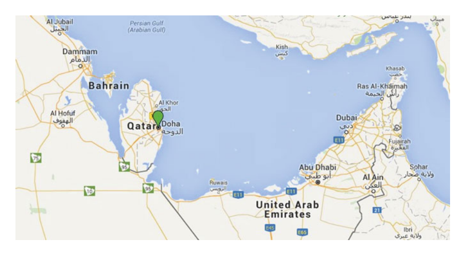
Fig. 2.5 Qatar's location in the Gulf region.

There are only few renewable natural water resources in Qatar, which are used mostly for agriculture and private consumption (Mohtar, 2016). Qatar's freshwater deficit is addressed by desalinated sea water. Desalination plants have high energy demand. However, "Qatar's domestic water use is among the highest in the world" (Mohtar, 2016, p. 297).