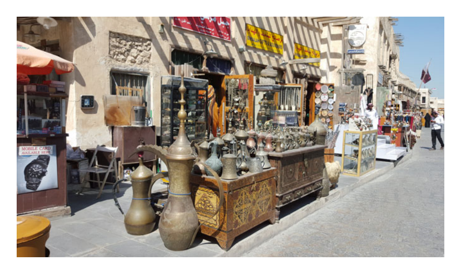
Fig. 2.9 Traditional goods at Souq Waqif

of Doha (Fig. 2.9). With the help of traditional construction techniques, the market is rebuilt as similar to the original as possible, in contrast to the new souk located directly by the sea. Surrounded by many shops, restaurants and cafes, the recreated shopping and meeting place is "a unique experiment to combine cultural heritage, tourist attraction, public realm and leisure space with the still remaining function as traditional market place" (Wiedmann, Mirincheva, & Salama, 2013, p. 30).