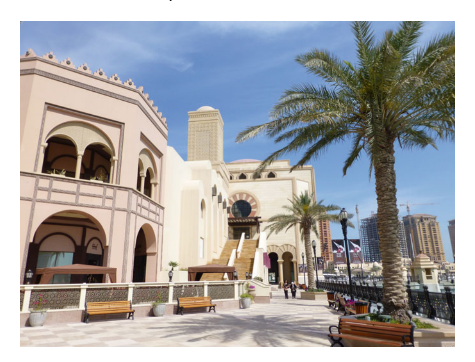
Fig. 2.17 The artificial Island The Pearl

Admittedly, the sudden wealth has incrementally changed the city space by constructing skyscrapers, high-rise buildings and mansions—one more impressive than the other. However, at the same time parts of the poor, nomadic lifestyle that characterized the life of nationals before the oil boom have been maintained: Tents decorate the desert that serve as hideouts for Qataris during the weekends and a traditional animal market where sheep, goats and even camels are sold still exists in the country (Fig. 2.18).