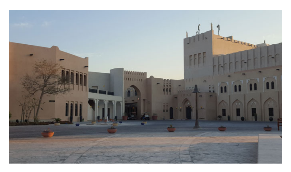
Fig. 2.4 Katara cultural village

world-class infrastructure and in the improvement of its education and healthcare systems (CIA, 2016). By hosting this renowned sports event, Qatar has successfully managed to attract global interest and awareness as well as the marketing of Qatar as a brand. It is safe to say that Doha became "an important emerging regional and global capital in the Middle East" (Salama & Wiedmann, 2013, p. xxi) that attracts attention not only to the oil and gas sector, but also to culture and sports, tourism, politics and policy initiation.