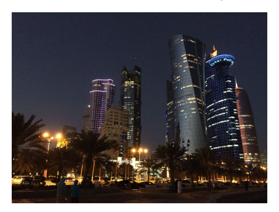
Fig. 2.15 Doha West Bay by night