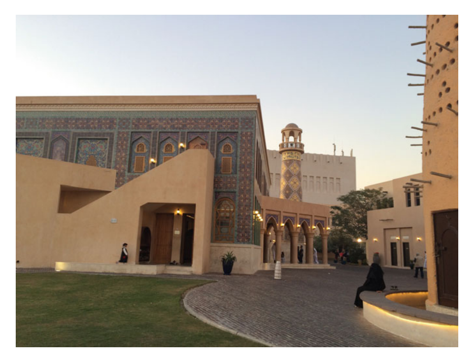
Fig. 2.7 Traditional Qatari buildings in Katara