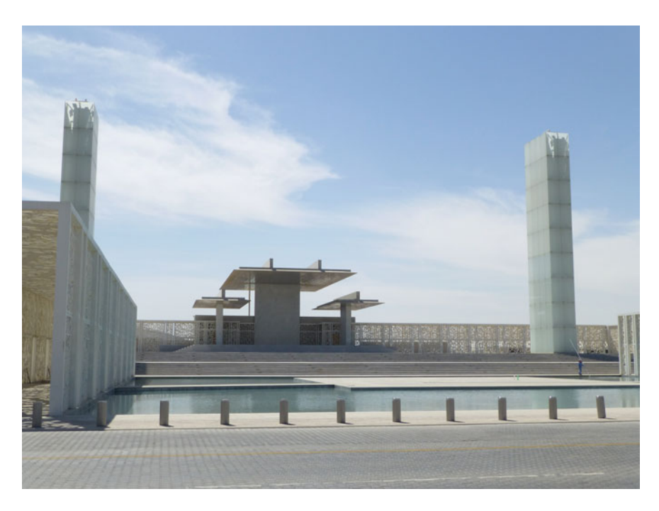
Fig. 2.13 Ceremonial court in Education City