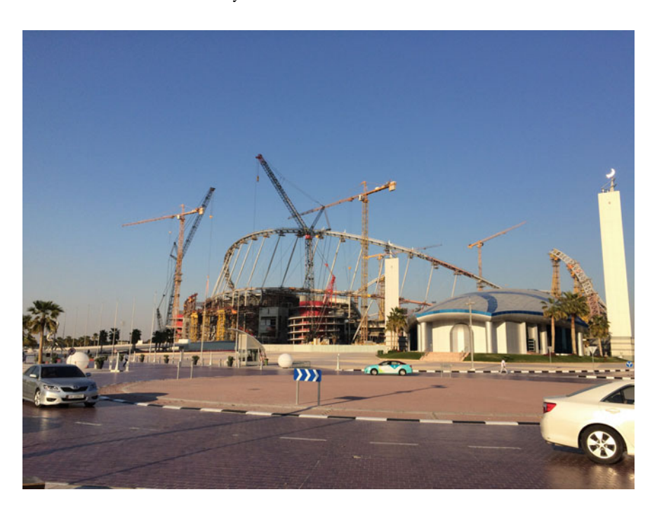
Fig. 2.19 The stadiums for the FIFA World Cup 2022 (here in the Aspire Zone) are still under construction

wealth of the nation, household work is not popular among Qatari. Nearly 80% of Qatari households employ at least one domestic worker; about 6% have 5 or more employees for housekeeping (Al-Ammari & Romanowski, 2016, p. 1550).