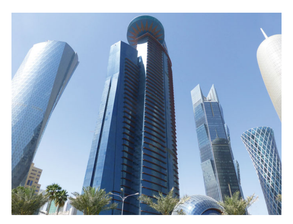
Fig. 2.10 Qatar Petroleum headquarters in the West Bay area

in Qatar, especially the powerful ones, strive to support this vision. One of them is Qatar Petroleum (QP), a state-owned public corporation which is responsible for all phases of the oil and gas industry (QP, 2015; Fig. 2.10). Its revenue in 2014 was about 169 billion QR (46 billion U.S. dollar) and its net income amounted to 113 billion QR (31 billion U.S. dollar) (QP, 2014).