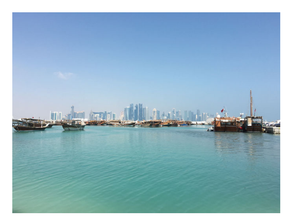
Fig. 2.3 Skyline of Doha's West Bay