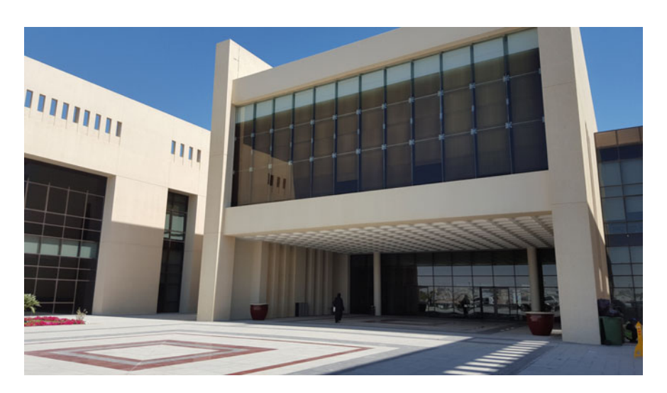
Fig. 2.14 Qatar University