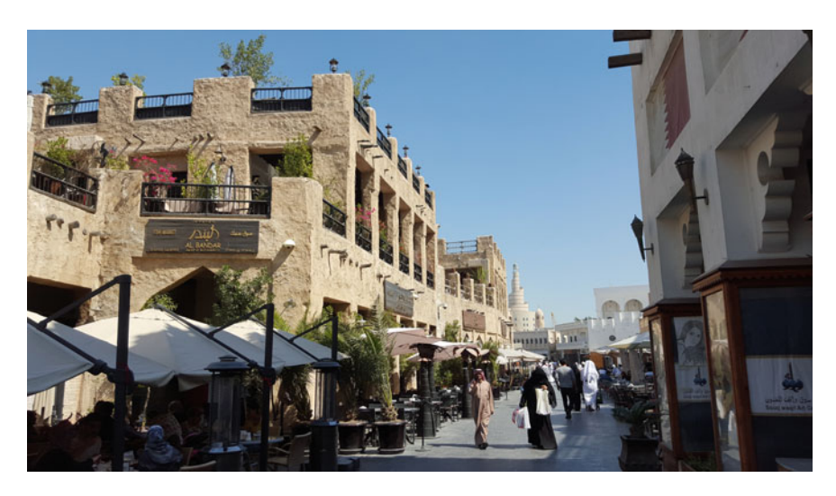
Fig. 2.2 Souq Waqif