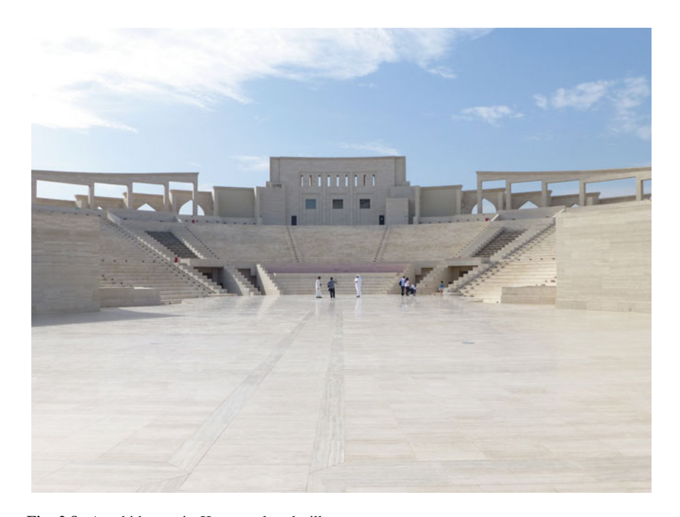
Fig. 2.8 Amphitheater in Katara cultural village