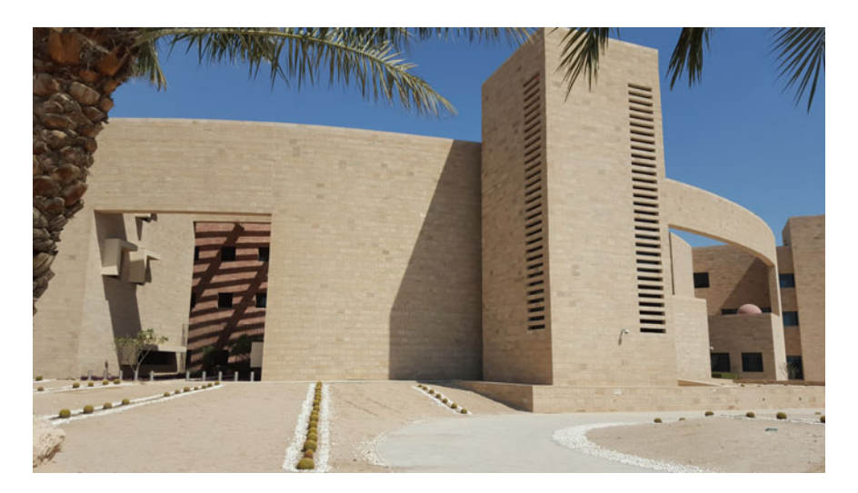
Fig. 2.12 Carnegie Mellon University in Qatar as an example for the prestigious architecture in Education City

Nowadays, the university has reached substantial international attention and is frequently mentioned in the international media. According to Times Higher Education, Qatar University is the most international university in the world. This is the result of the 2015–2016 ranking of 800 universities considered altogether. The