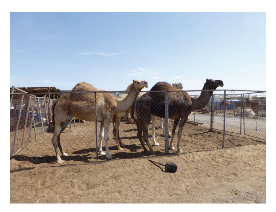
Fig. 2.18 Qatar animal market

World Cup in 2022, unskilled workers are needed for project-related work (Fig. 2.19) and thereby face conditions of modern slavery (Dorsey, 2015).